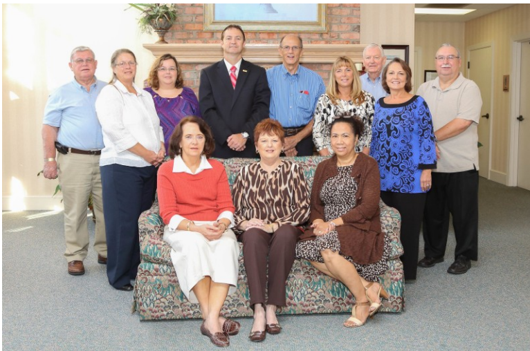
Richmond County Hospice Board of Directors 2014