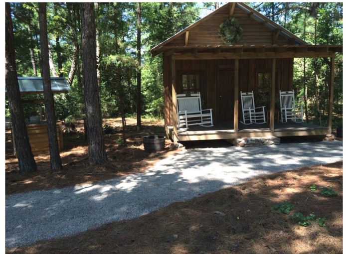
“Front porch” sitting along the Walk To Remember walking path

Our mission at Richmond County Hospice, Inc. is to comfort the body and heal the heart through compassionate quality care during end-of-life experiences, so patients and families may live each day with peace, comfort, and dignity.